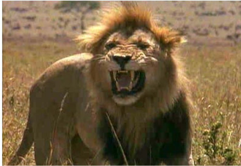
A room filled with lions who have not eaten for three years.