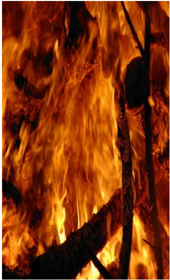
A room with raging fire.